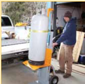
Contractor Supply Houses