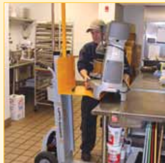
Equipment Repair / Installation