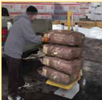
Landscape Supply & Nurseries