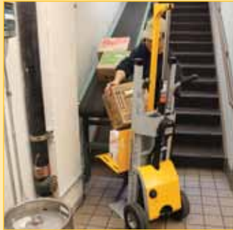
Shipping & Receiving