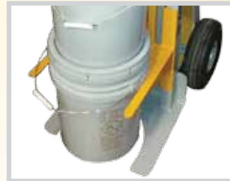
5 Gallon Pail Attachment