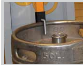
Keg/Cylinder Handling Kit