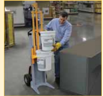
Paint Supply Outlets