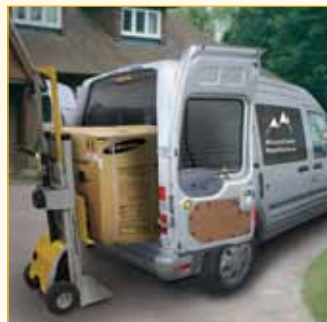
Small Appliance Delivery