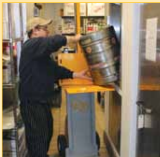
Bars & Restaurants