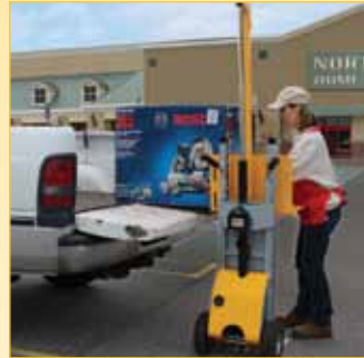
Home Centers / Box Stores