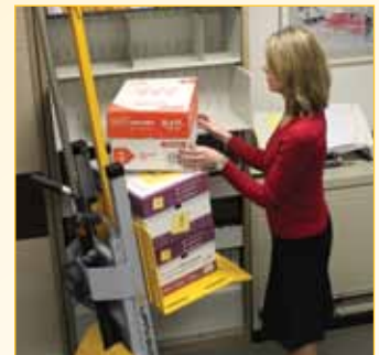
Offices & Medical Facilities