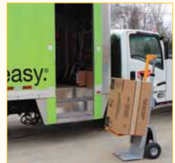
Route Delivery Trucks