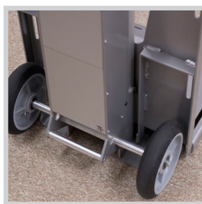
Kick axle for easy tilting of LNB-2 for load transport.