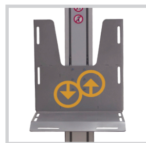
Platform slots for securing loads with bungees or straps.