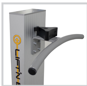
Ergonomic handle with lifting and lowering thumb switch.