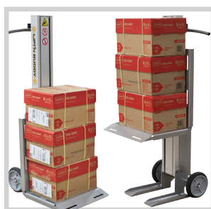
Base legs allow unit to stand even when raised under load.