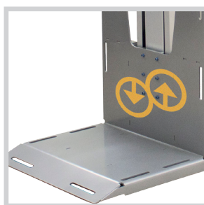
Large 20" x 16" platform with load backrest and angled lip.